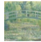
37 The Water-Lily Pond, 1899 Claude-Oscar Monet Coppergate Centre (riverside walk)