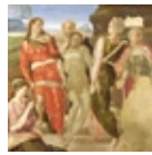
18 The Entombment, about 1500 - 01 Michelangelo St Helen's Graveyard, Davygate