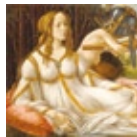
17 Venus and Mars, about 1485 Sandro Botticelli City Screen, Coney Street