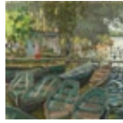
14 Bathers at La Grenouillère, 1869 Claude-Oscar Monet Lendal Tower, Dame Judi Dench Walk