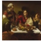
21 The Supper at Emmaus, 1601 Michelangelo Merisi da Caravaggio Dean Court Hotel, High Petergate