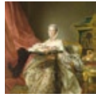
44 Madame de Pompadour at her Tambour Frame, 1763 - 64 François-Hubert Drouais Castle Museum