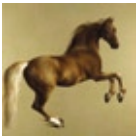
1 Whistlejacket, about 1762 George Stubbs Exhibition Square