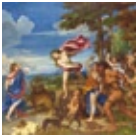
8 Bacchus and Ariadne, 1520 - 23 Titian Yorkshire Museum