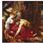
28 Samson and Delilah, about 1609 - 10 Peter Paul Rubens St Sampson's Church (Annexe)