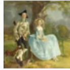
39 Mr and Mrs Andrews, about 1750 Thomas Gainsborough Fairfax House, Coppergate Centre