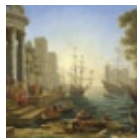
12 Seaport with the Embarkation of Saint Ursula, 1641 Claude The Hospitium, Museum Gardens