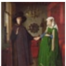
11 The Arnolfini Portrait, 1434 Jan van Eyck The Hospitium, Museum Gardens