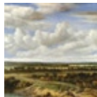
30 An Extensive Landscape with a Road by a River, 1655 Phillips Koninck Newgate, The Shambles