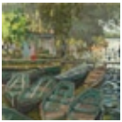
14 Bathers at La Grenouillère, 1869 Claude-Oscar Monet Lendal Tower, Dame Judi Dench Walk