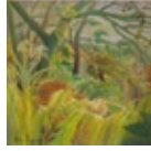
22 Surprised! (Tiger in a Tropical Storm), 1891 Henri Rousseau 36 High Petergate