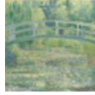
37 The Water-Lily Pond, 1899 Claude-Oscar Monet Coppergate Centre (riverside walk)