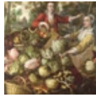
29 The Four Elements: Earth, 1569 Joachim Beuckelaer 4 Jubbergate