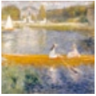
13 The Skiff, 1875 Pierre-Auguste Renoir Water Tower, Dame Judi Dench Walk