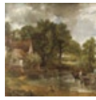
36 The Hay Wain, 1821 John Constable Coppergate Centre (riverside walk)