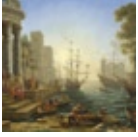
12 Seaport with the Embarkation of Saint Ursula, 1641 Claude The Hospitium, Museum Gardens