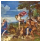
8 Bacchus and Ariadne, 1520 - 23 Titian Yorkshire Museum