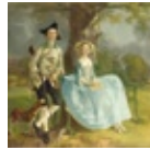
39 Mr and Mrs Andrews, about 1750 Thomas Gainsborough Fairfax House, Coppergate Centre